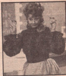
Lucille Ball hosts a segment of "The Fabulous Fifties" at 7 p.m. Sunday on Channel 5.