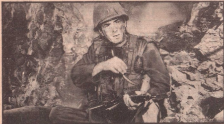
Gregory Peck stars as Lt. Joe Clemons in "Pork Chop Hill"