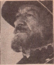
The Incan god-king Atahualpa (left) and his conqueror, Francisco Pizarro

the actual explorations took place. Locations included the Andes, the Sahara, the African jungle, the Arctic Circle and the central Australian plain.