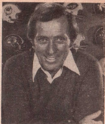
Andy Williams is one of the hosts of "Super Night at the Super Bowl" at 8:30 p.m. Saturday on Channel 2.

Senior Bowl. Noon, Channel 2 (CBS). College all-stars from the North and South meet in annual classic in Mobile, Ala.