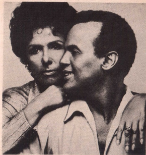
Lena Horne and Harry Belafonte as they'll appear on their ABC-TV special Sunday night at 7 p.m.

She has been married for 22 years to Lennie Hayton, the musician and