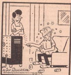
"Looks like more than the bases are loaded!"

Americas .....11 Gov. Luis Munoz Marin of Puerto Rico explains Operation Bootstrap and gives his views on the Cuban situation and the United States' attitude toward Latin America.