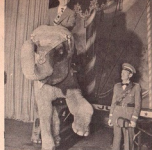
Elephants are always good for a startling performance on the show. But one time, a troupe of the critters refused to enter the Civic Opera building until workers screened a Wacker Drive excavation.

As a producer Patton can frown on such antics. But as a showman practically born in the theater—his parents were featured stage players—he knows