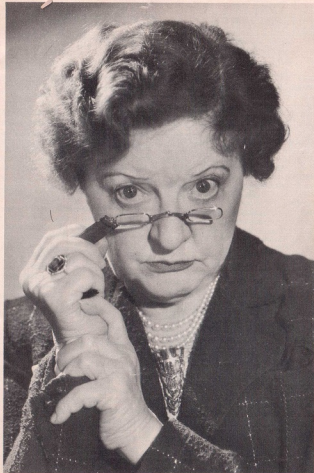
Marion Lorne, the delightfully scatterbrained associate of Wally Cox (Mr. Peepers), was a comedy star in her own right for more than 25 years on the London stage. But she's actually a native of the United States. She's a big reason for the success of the NBC-TV chuckler.