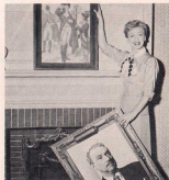
Down goes principal Osgood Conklin, while George Washington takes over in the place of honor. Washington's birthday is one of few times that "Our Miss Brooks" gets a breather.

To her portrayal she brings what her fans demand as indicated in the heavy volume of mail she receives a good deal of it from the teaching profession. She attempts and actually succeeds in portraying the teachers as they are after all.