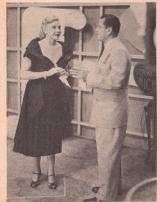
Warren Hull with actress-singer Benny Venuto. Program "coaxes" celebrities to come up with right answers, and therefore help out the unfortunate families. For the celebs, it's great publicity.

I'll presume the charitable presumption that the people involved in this particular program know good taste when they see it, but are willing to sacrifice it in order to earn more