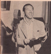
Jerry Lester, who ran up a chunk of fame and fortune with NBC's old "Broadway Open House" some years back, and then kicked it away, looks like a sure bet to repeat on his current afternoon show.

"So now I'm a big TV guy, eh? Well, I wanna tell you how I got started. I lived as a kid out in Humboldt Park in Chicago. Made some bucks, believe me, heisting cars.