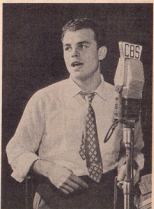
Julius La Rosa... in a lawsuit.

Don Herbert , star of "Mr. Wizard," reports his Mr. Wizard's Science Secrets is still a big seller in leading bookstores. It's published by Popular Mechanics press.