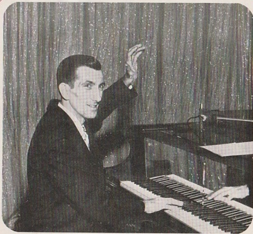
AL MORGAN OF WGN-TV