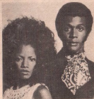
Melba Moore and Clifton Davis will co-star in a musical-comedy series starting Wednesday on Channel 2 at 7 p.m.