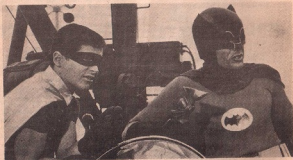
Adam West (right) and Burt Ward are Batman and Robin, the Dynamic Duo, in "Batman" Sunday at 8 p.m. on Channel 7 (ABC-TV).

MONDAY: Captain Kangaroo. 8 a.m. Channel 2 (CBS). Rerun. All this week the good Captain broadcasts tapes of his visit to Washington D.C., giving the youngsters a fine look at the nation's capital.