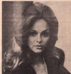
Lynda Day George

● LYNDA DAY of Mission Impossible , the wife of actor Chris George , now insists on being billed as Lynda Day George . "I love my husband and I want to use my married name. I get a funny feeling when people call me 'Miss Day.' . . . NBC's Joseph Campanella is honorary mayor of