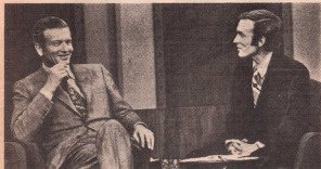
John V. Lindsay (left), mayor of New York City, is Dick Cavett's sole guest Thursday at 10:30 p.m. on Channel 7 (ABC-TV).