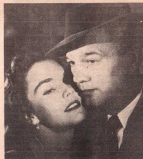
Jennifer Jones and Joseph Cotten star in "Portrait of Jennie," David O. Selznick's 1949 film, Tuesday at 7:30 p.m. on Channel 7.

FRIDAY: "Travis Logan, D.A." 8 p.m. Channel 2 (CBS). Vic Morrow prosecutes Hal Holbrook (formerly of The Senator), who breaks into an apartment, discovers his wife (Brenda Vaccaro) in a "tryst" (CBS publicity doesn't define exactly what that means), murders a man, pleads insanity and faces Morrow in court.